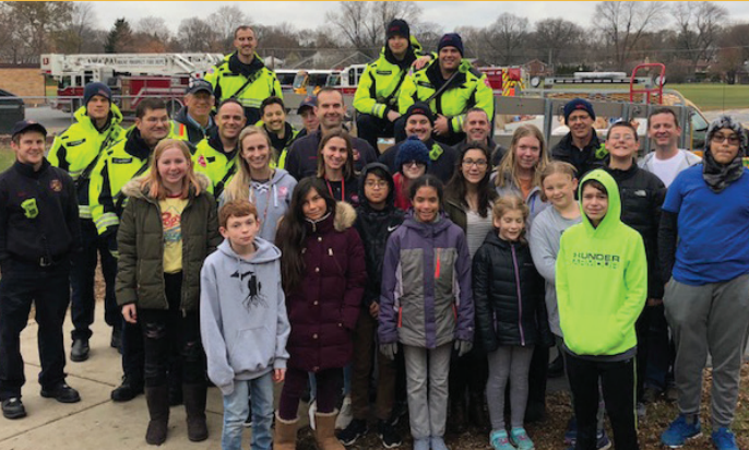
Lincoln Student Council plans schoolwide events that include an annual Thanksgiving food drive, held in partnership with the Mount Prospect Fire Department. This year's drive collected 1,700 items, doubling 2017 totals. Firefighters helped Lincoln students and staff load the donations onto their trucks Nov. 16, then delivered the items to the local food pantry.