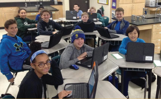
In Lincoln's new Computer Science Club, members explore digital storytelling and coding. Through Google's CS First curriculum, they learn how to bring stories to life on their computers by designing and sharing their own animations. They also explore how technology is used in the film and media industries.